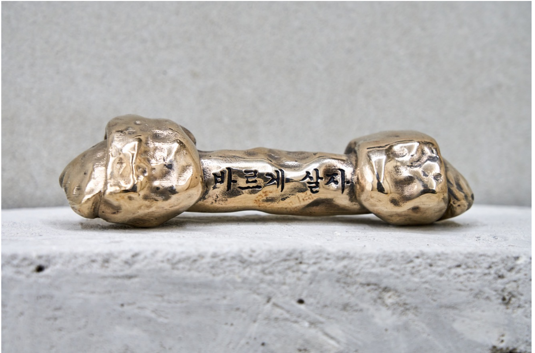
The Series of Tools for Spiritual Practice (Live Right), 2025, bronze with wax polish and ink, 15 x 5 x 5 (h) cm