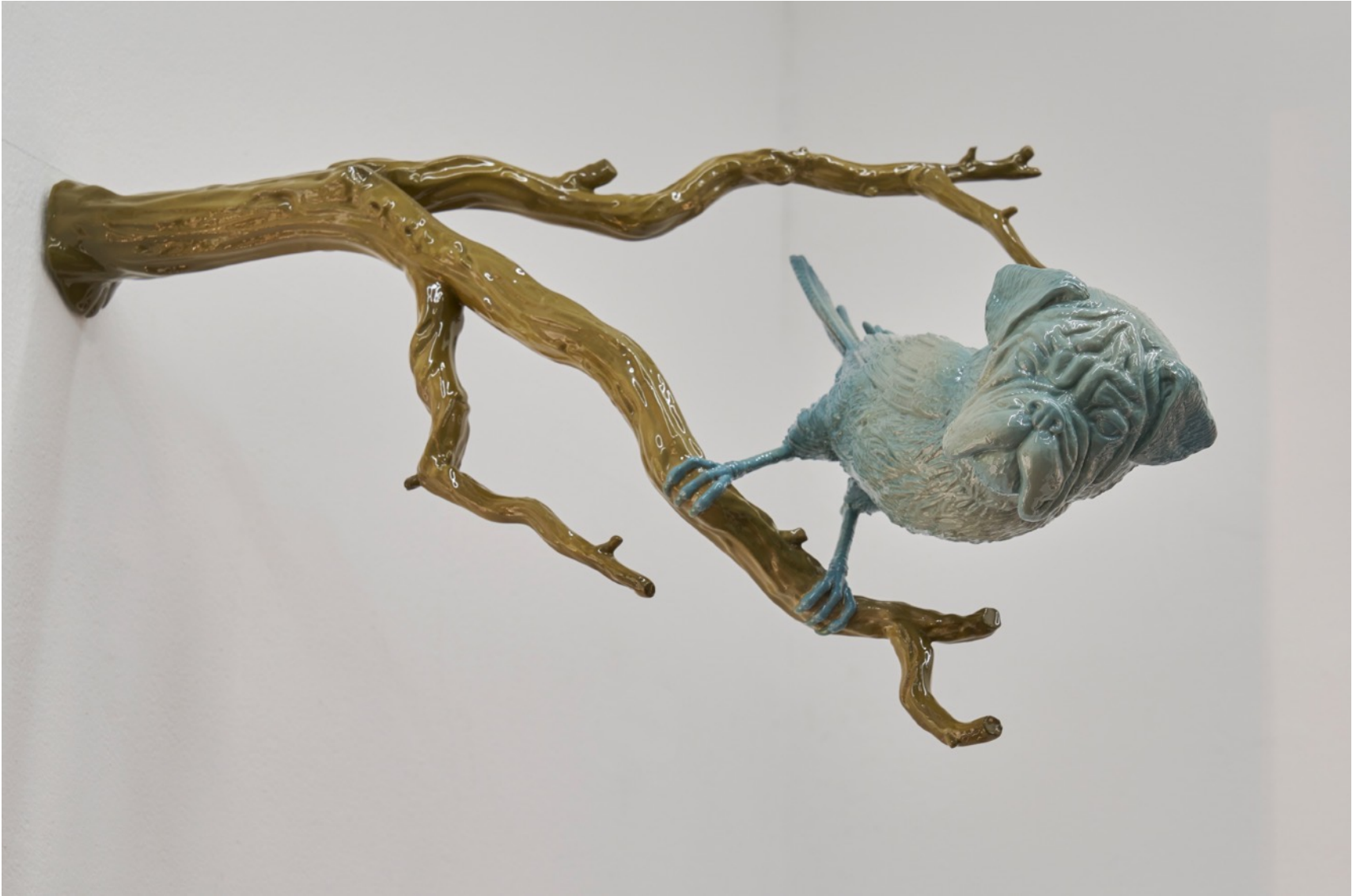
나뭇가지위에 개새 ( Dog Bird on Branch ), 2024, acrylic epoxy on resin, 19 x 24 x 40cm(h)