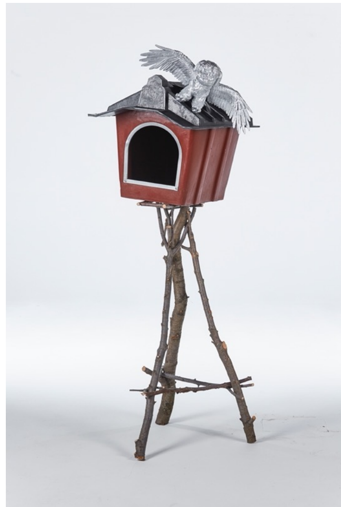
개새 집 Dog House , 2023, acrylic on resin, 60 x 60 x 150 cm