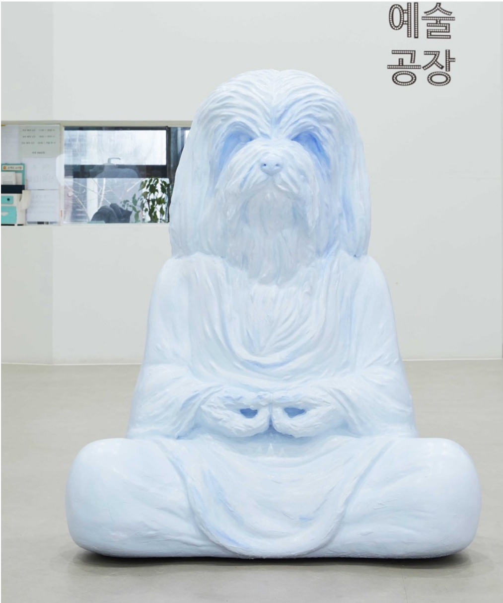
The Great Dog 2 , 2021, acrylic, gypsum, epoxy putty, aluminum panel and various material on styrofoam, 150 x 90 x 170cm