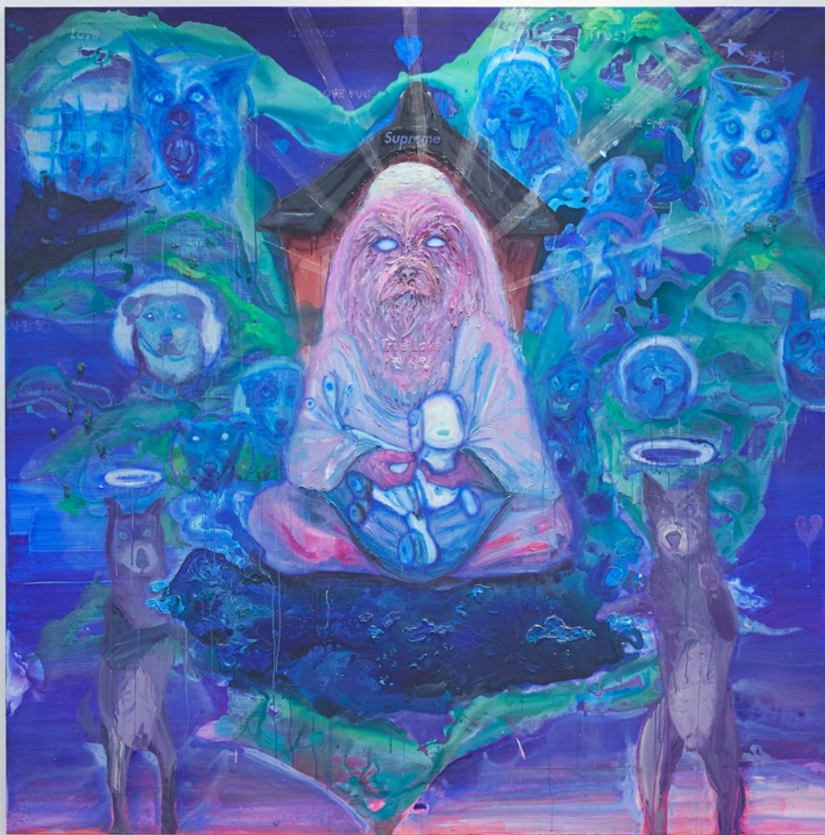
True Love 찐사랑 , 2021, acrylic on canvas, 200 x 200 cm