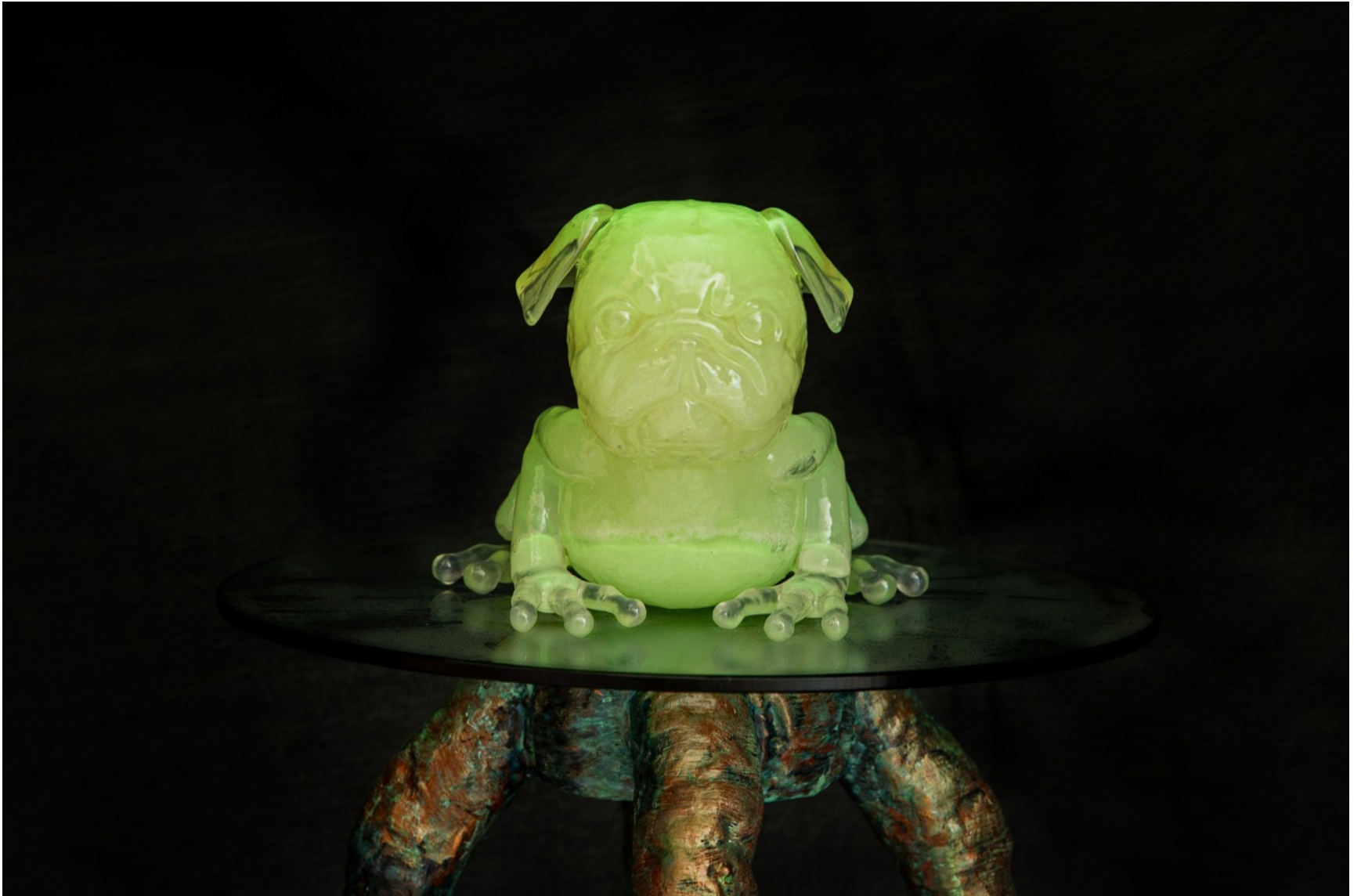
야광 개구리 Dogrog (Fluorescent) , 2023, phosphorescent pigments and epoxy on resin