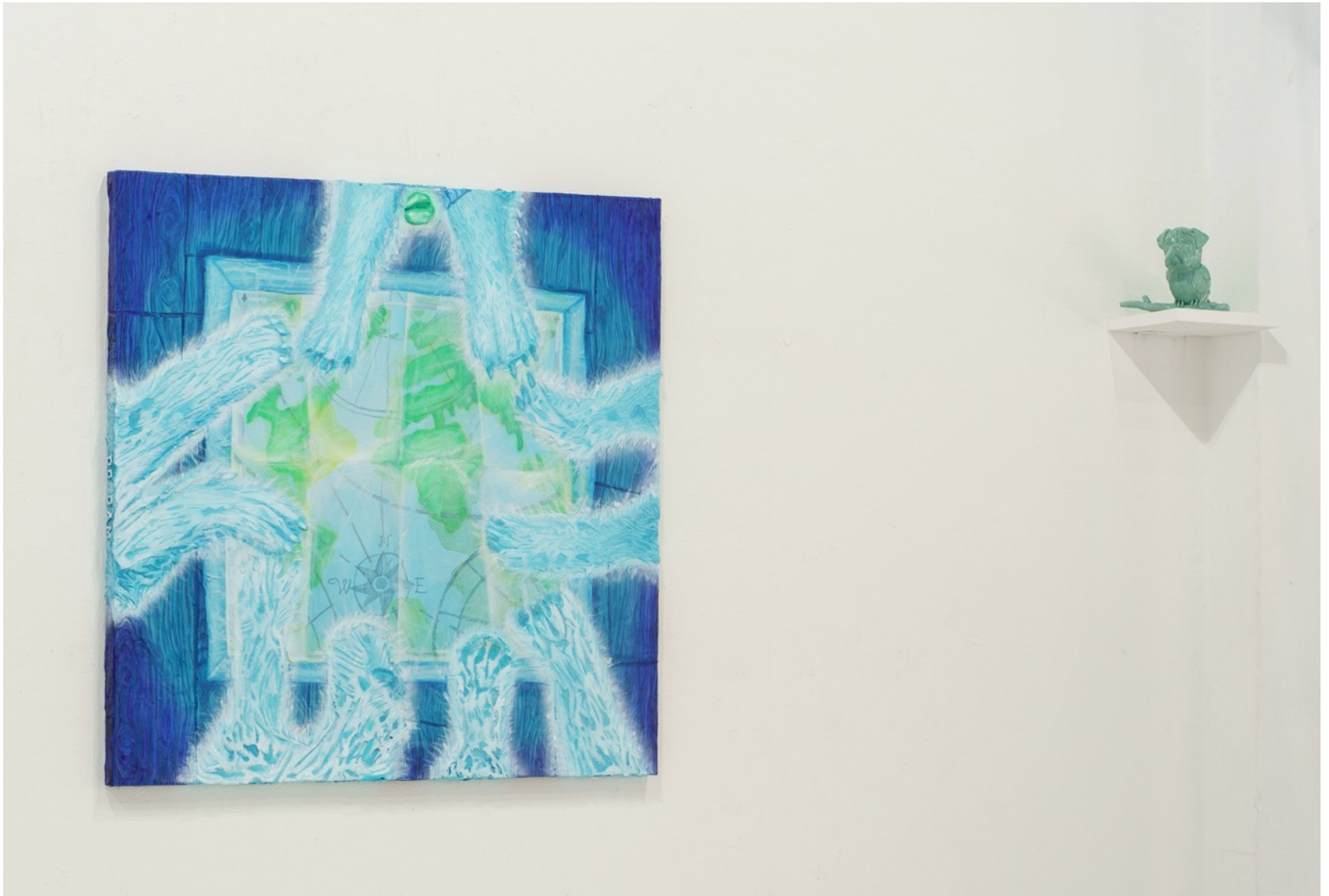
G5, 2024, acylic on canvas, 80 x 80 cm