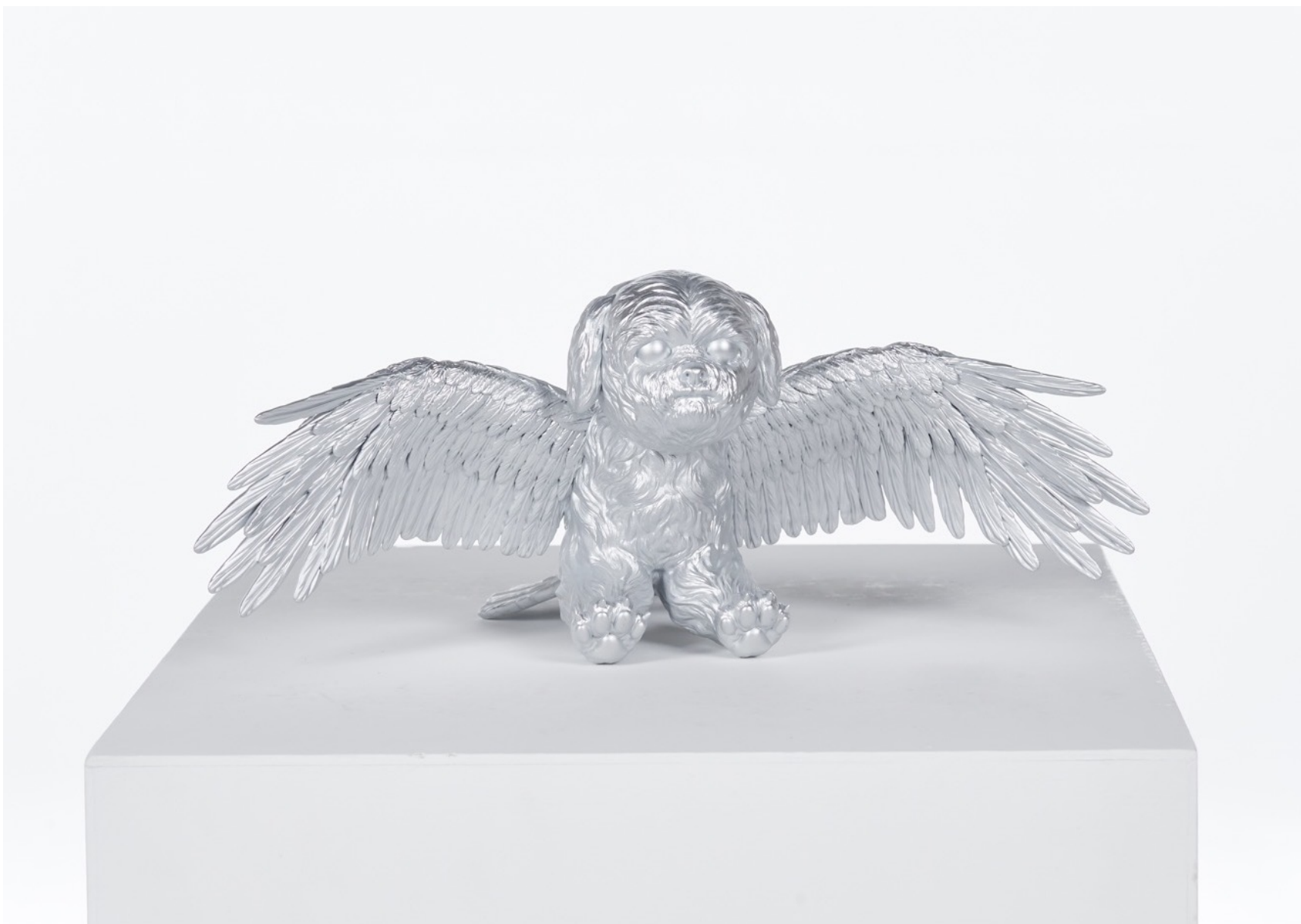
Dog - Bird 2 개새 2 , 2023, acrylic on resin, 14.5 x 36 x 27.5 cm