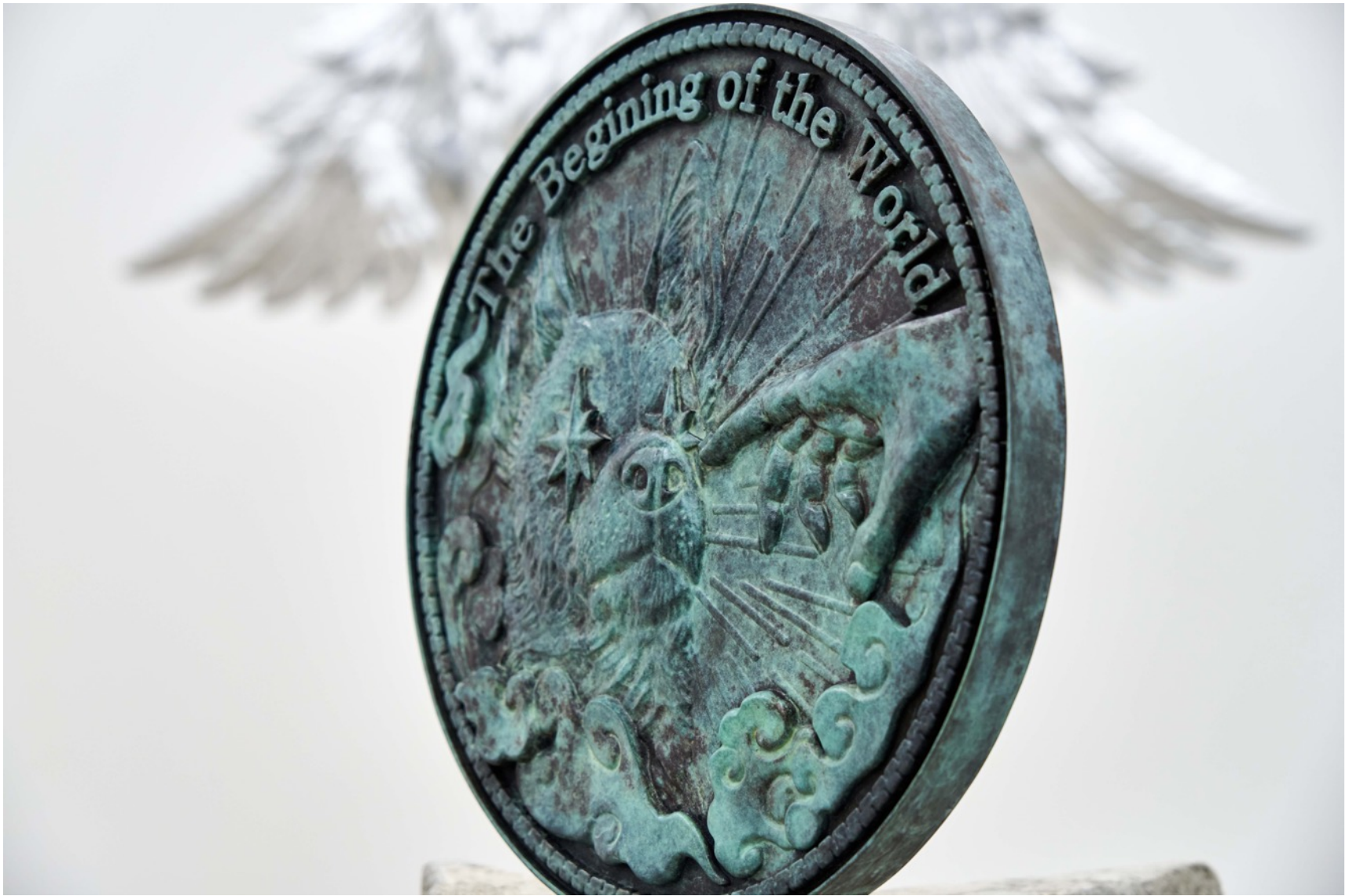
Doggie Coin 2 (The Beginning of the World) , 2025, patinated bronze with wax finish. 30 x 3 x 30 (h) cm.