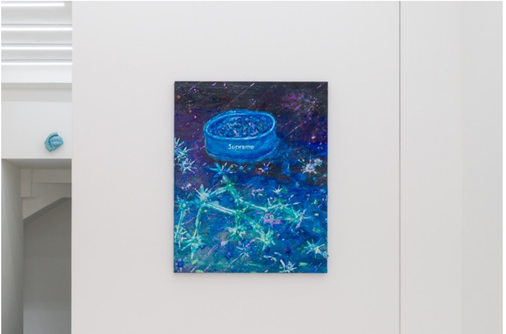
Supreme , 2023, acrylic, acrylic medium, water based marker and pigment powder on canvas, 91 x 72 cm