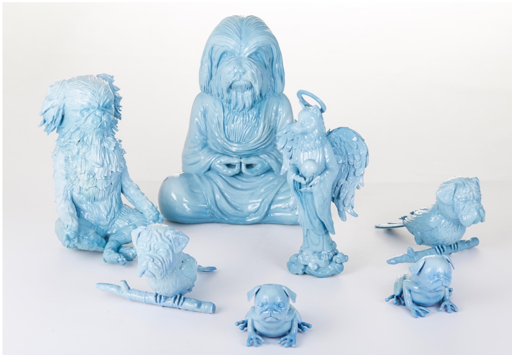
The Series of Energetic Dosa, acrylic on resin, 2023