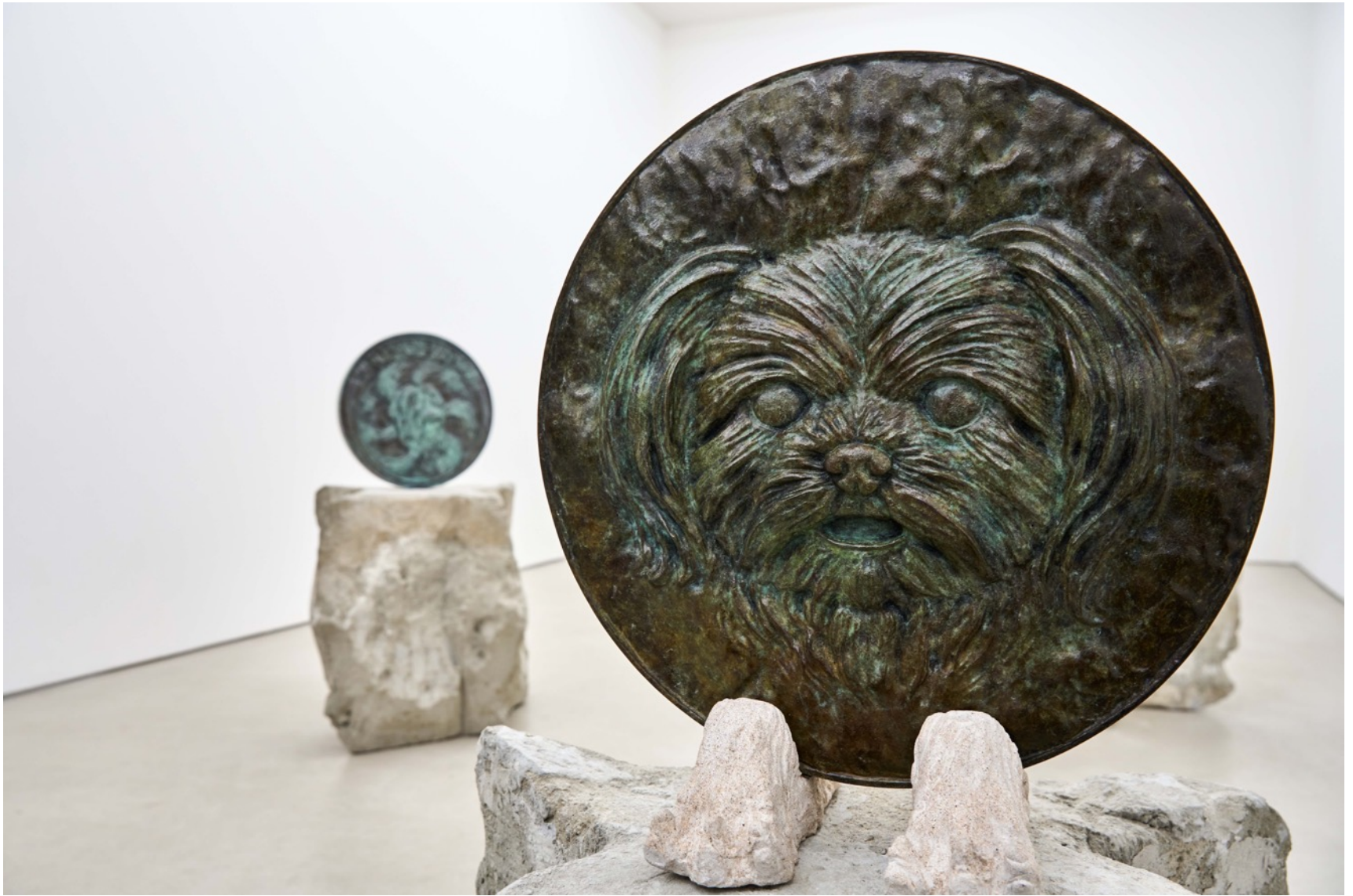
Doggie Coin 3 (Forever) , 2025, patinated bronze with wax finish. 30 x 3 x 30 (h) cm.