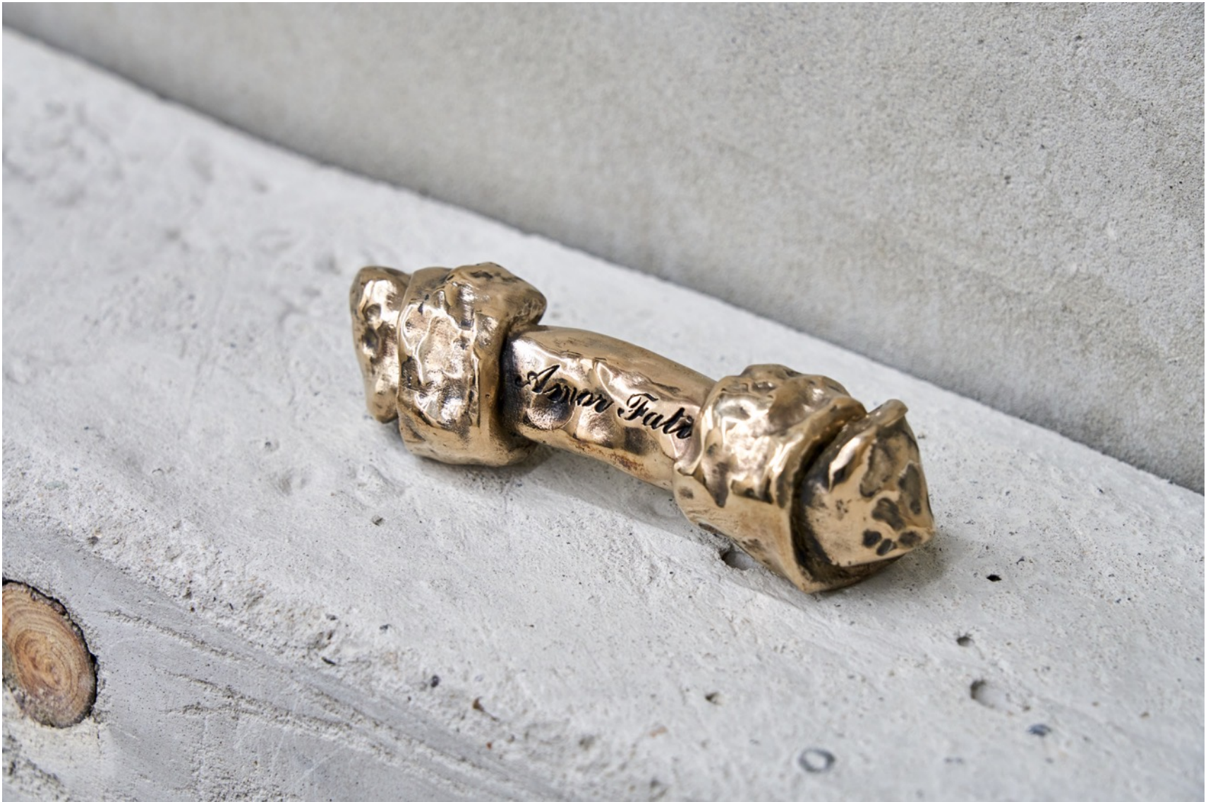
The Series of Tools for Spiritual Practice (Amor Fati), 2025, bronze with wax polish and ink, 14 x 5 x 5 (h) cm