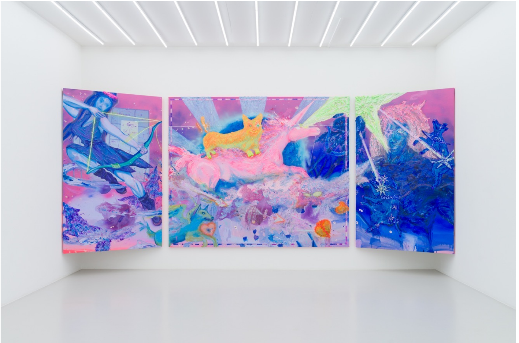
End of Summer, 2023, acrylic, acrylic medium, water based marker and pigment powder on canvas, 210 x 120, 210 x 240, 210 x 120 cm (From left)