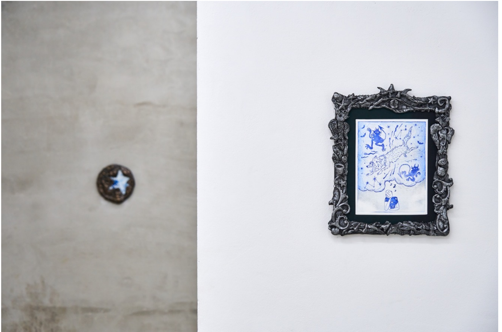
In Some Dream, 2025, etching on copper plate, printed with ink on paper, framed with resin, chrome powder, and wax finish