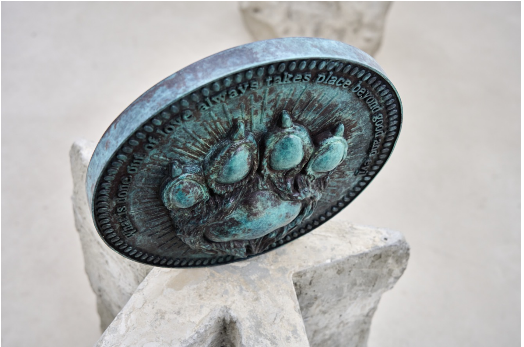
Doggie Coin 2 (The Beginning of the World) , 2025, patinated bronze with wax finish. 30 x 3 x 30 (h) cm.