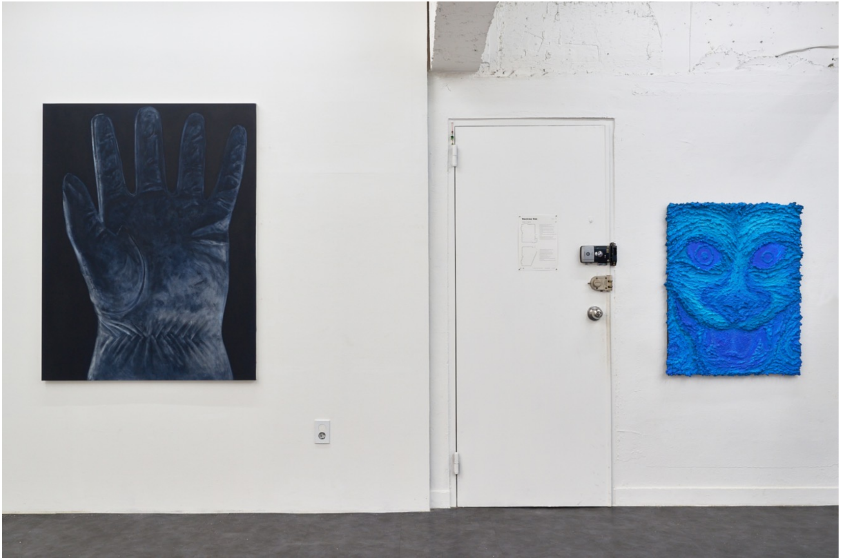
Face (Talisman series) , 2024, acrylic and epoxy putty on canvas, 75 x 93 cm