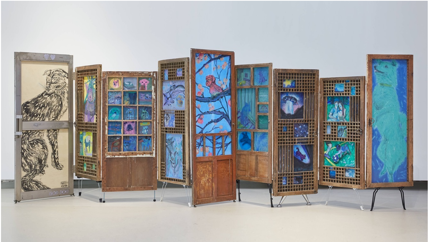
The Door Series 1 문짝 시리즈 1, 2021, acrylic and pigment on Hanji with door.